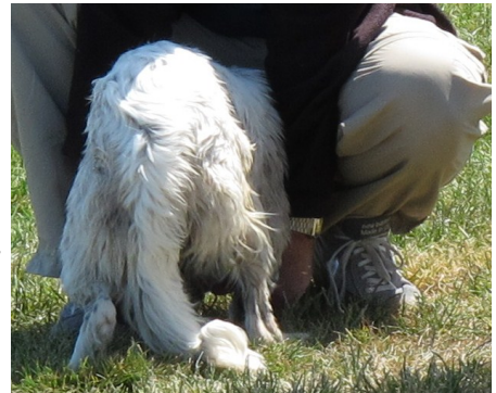
body lowered tail tucked