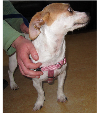
turning head away ears pinned back wide, round eyes