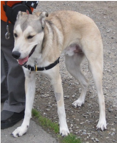
ears pinned back, stress-pant rounded back tail tucked