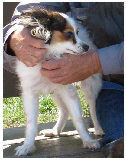
mouth tensely closed, wide, round eyes, and front legs bracing to lean away