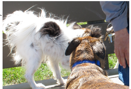
shaking off (to release tension after stressful event)