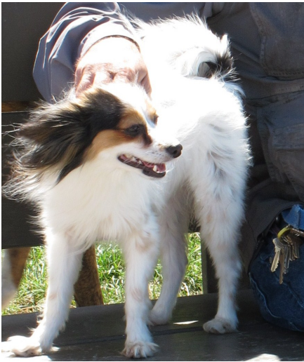
change from mouth open and soft eyes to: