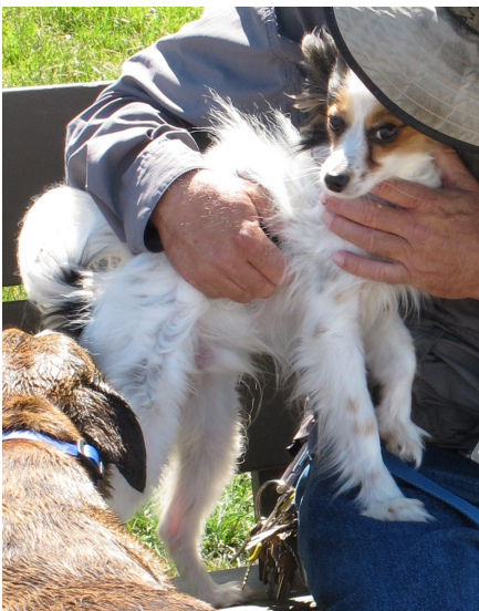
turning head away trying to lean away