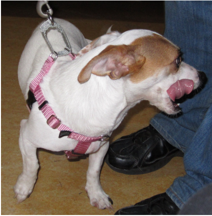
turning head away ears pinned back lip-licking paw raise